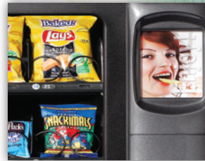
Back lighted point of sale window for advertising and specials.