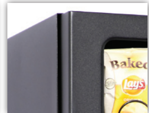
Door-In-Cabinet Design Adds security and rigidity to an already solid package.