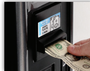
Premium Currency Acceptors Includes standard electronic coin acceptor and $1 & $5 bill acceptor.

Keep your customers happy by with all their favorite chips, crackers, cookies, candy & confections.