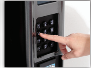
Large and easy to read selection buttons with Braille identification.