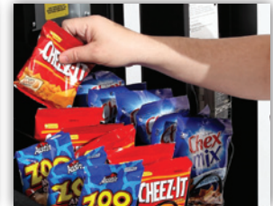
Dispenses All Brand Name Products

Keeps customers satisfied and reduces service calls for misloaded product.