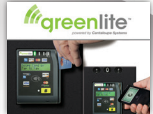
Credit/Debit & mobile reader options.