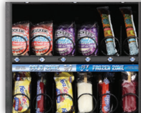
Vends all types of refrigerated & frozen meals, sandwiches & deserts.