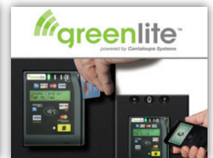
Credit/Debit & mobile reader options.

Hold up to 60 canned or bottle beverages.