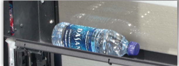
Elevator Gently Delivers a Wide Range of Beverage & Dairy Products