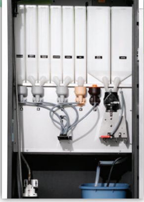
State-Of-The-Art Brewing System Simple brewing system and filtering ensure a high quality, consistent drink (No Filter Paper Required)