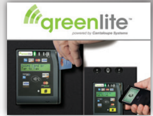
Credit/Debit & mobile reader options.