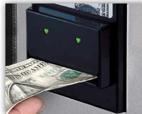
Premium Currency Acceptors

Keep your customers happy by with all their favorite chips, crackers, cookies, candy & confections.