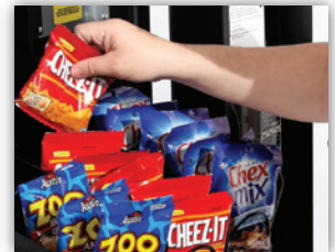
Dispenses All Brand Name Products

Keeps customers satisfied and reduces service calls for misloaded product.