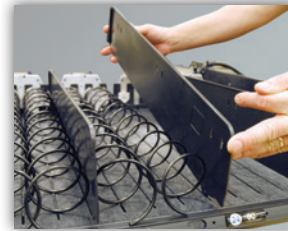
Re-configure trays to almost any package size in the field with no need for tools.