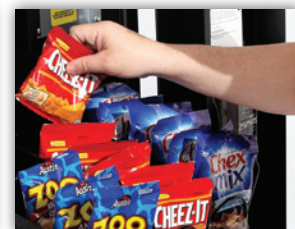
Dispenses All Brand Name Products

Keeps customers satisfied and reduces service calls for misloaded product.