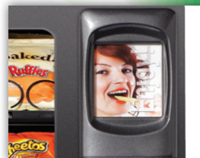
Back lighted point of sale window for advertising and specials.