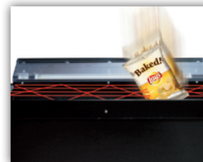
iVend® Guaranteed Delivery System

Keeps customers satisfied and reduces service calls for misloaded product.